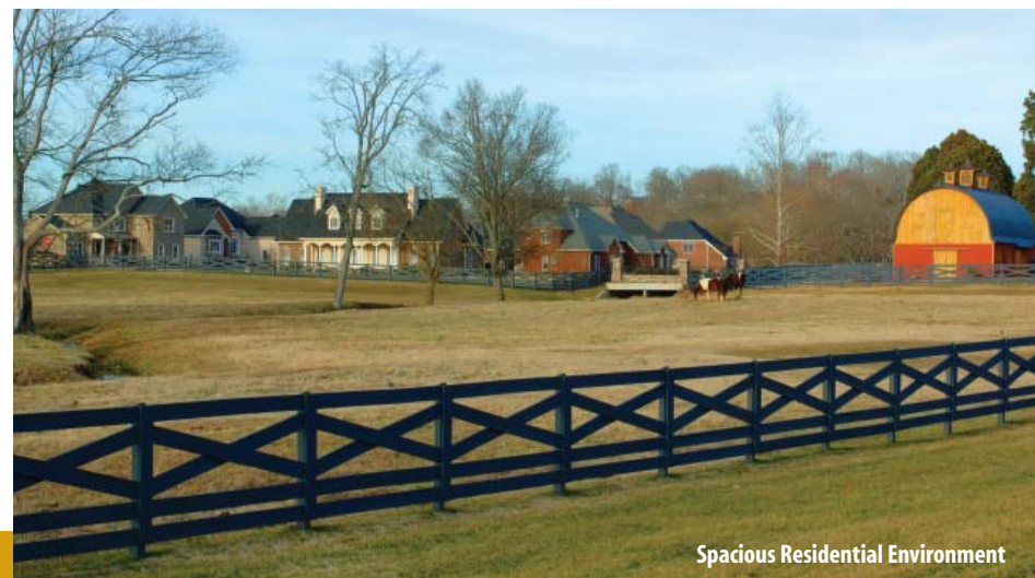
Spacious Residential Environment

Growth in county median home value has outpaced both the state and nation.