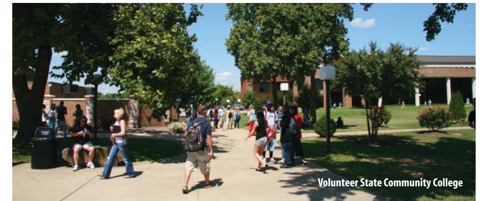
Volunteer State Community College