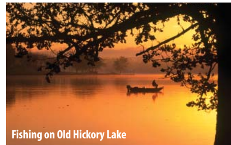
Fishing on Old Hickory Lake

The Cumberland River forms the southern border of Sumner County and offers full river barge access to the Gulf of Mexico, via the Ohio, Tennessee and Mississippi Rivers.